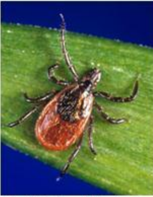
The black-legged tick, Ixodes scapularis , is the vector for Lyme disease in Ohio.

Lyme disease is caused by the bacterium Borrelia burgdorferi and is transmitted to humans through the bite of infected blacklegged ticks. Typical symptoms include fever, headache, fatigue and a characteristic skin rash called erythema migrans (the “bull’s-eye” rash). If left untreated, infection can spread to the joints, heart and nervous system. Lyme disease is diagnosed based on symptoms, physical findings (e.g., rash) and the possibility of exposure to infected ticks; laboratory testing is helpful if used correctly and performed with validated methods. Most cases of Lyme disease can be treated successfully with a few weeks of antibiotics. Steps to prevent Lyme disease include using insect repellent, removing ticks promptly, applying pesticides and reducing tick habitat. The ticks that transmit Lyme disease can occasionally transmit other tick-borne diseases as well.